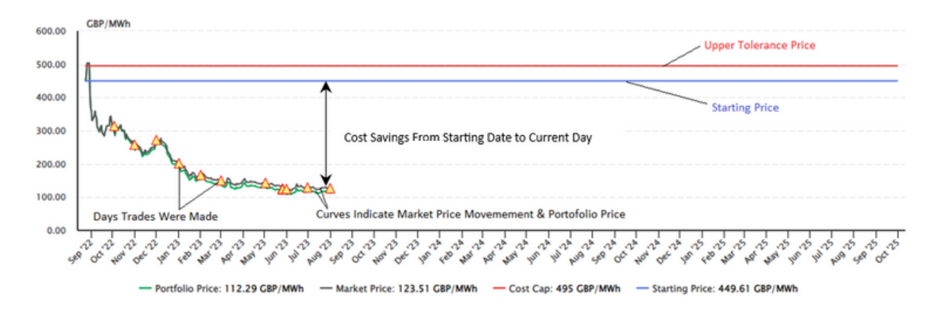
The blue line indicates the wholesale price on the date the contract was signed. This is the main benchmark we aim to buy below. Black & green lines indicate the price movement of the market & portfolio. Yellow triangles indicate when we have purchased. This scenario highlights the market drop and subsequent purchases we made, far lower than a day 1 fix.

Instead of the traditional method of paying a fixed price monthly for your energy (which can be costly if bought at the wrong time), Flexible purchasing empowers you to take advantage of dips in the market, which allows you to reduce your energy bills and have more control over your costs. Prices will fluctuate over the duration of your agreement, and you are not obligated to the same expensive arrangement every month.